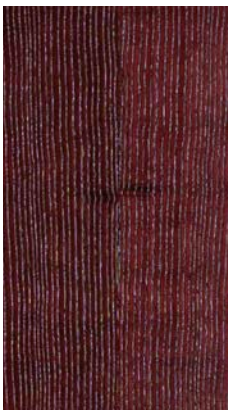
Red Shellac Ash

_The finishes shown are indicative and refer to the entire production range. Laurameroni reserves the right to modify the range without warning.