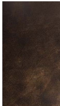
Dark Bronze Delabrè

_The finishes shown are indicative and refer to the entire production range. Laurameroni reserves the right to modify the range without warning.