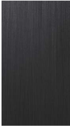
Brushed Matt Lacquered