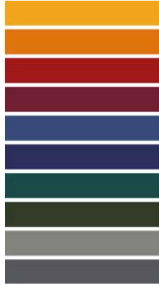
Available in all RAL/NCS Colors