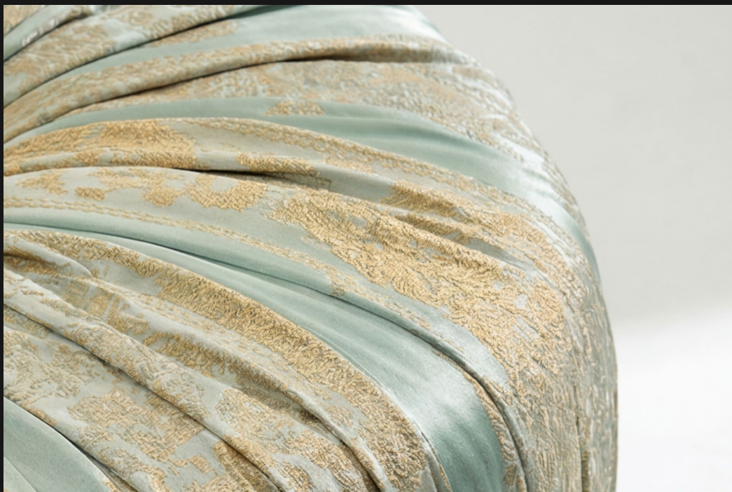
A detail of our Drapè Poufs in a special edition for Artemest.

Our sincere thanks to the interior design studios that selected us: Urjowan Interiors, Rockwell Group, and March and White Design.